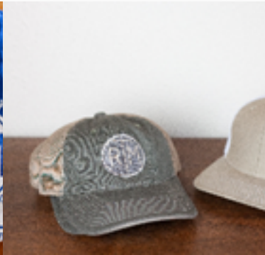
Baseball Cap $20