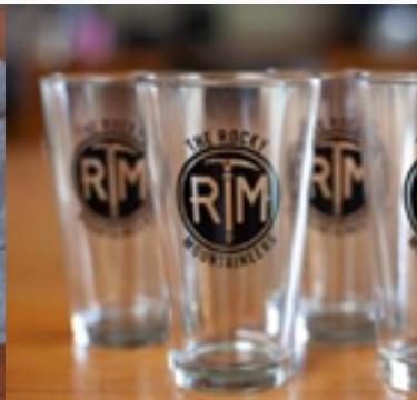
Pint Glass $10