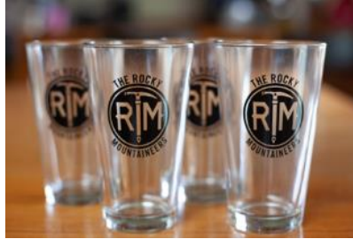
Pint Glass $10