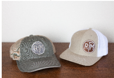
Baseball Cap $20