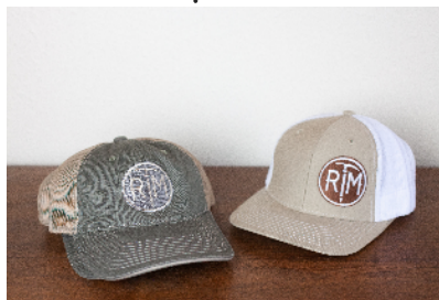
Baseball Cap $20