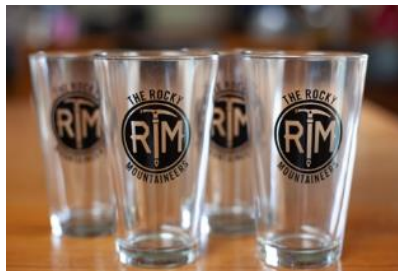
Pint Glass $10